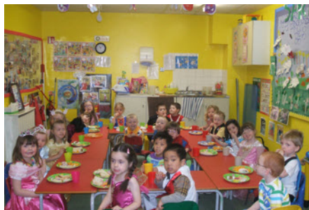
We enjoyed our Easter party and did lots of dancing.