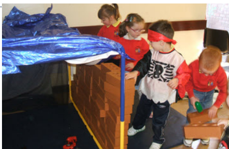
The children worked together and used bricks to build a wall for our den.

We will also be introducing "Tufty" to encourage road safety, awareness of traffic and spotting potential dangers.