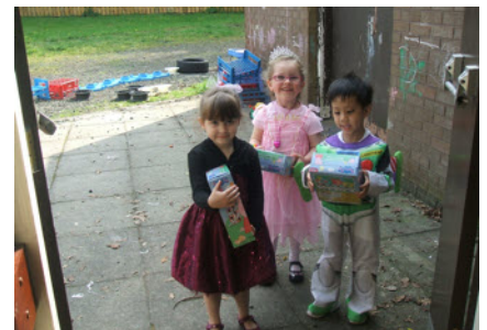
We went on an Easter egg hunt outside!